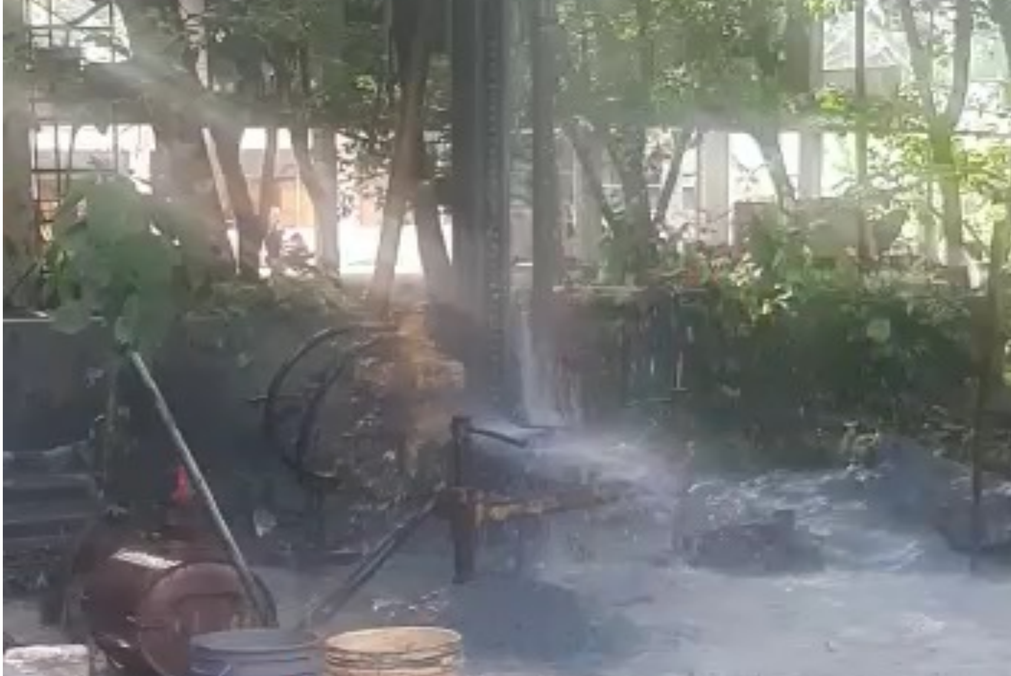
Water Well- India